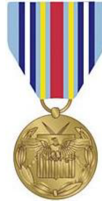
Global War on Terrorism Expeditionary Medal

Also planned are votes on a bill attempting to expand access for military recruiters to college campuses and a non-binding resolution asking the Defense Department, banks and credit unions and the Federal Trade commission to all work to reduce the financial hardships of mobilized reservists.